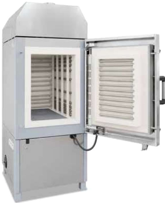
Chamber furnace N 300/14 DB200 for debinding and pre-sintering of zirconia blanks in the production