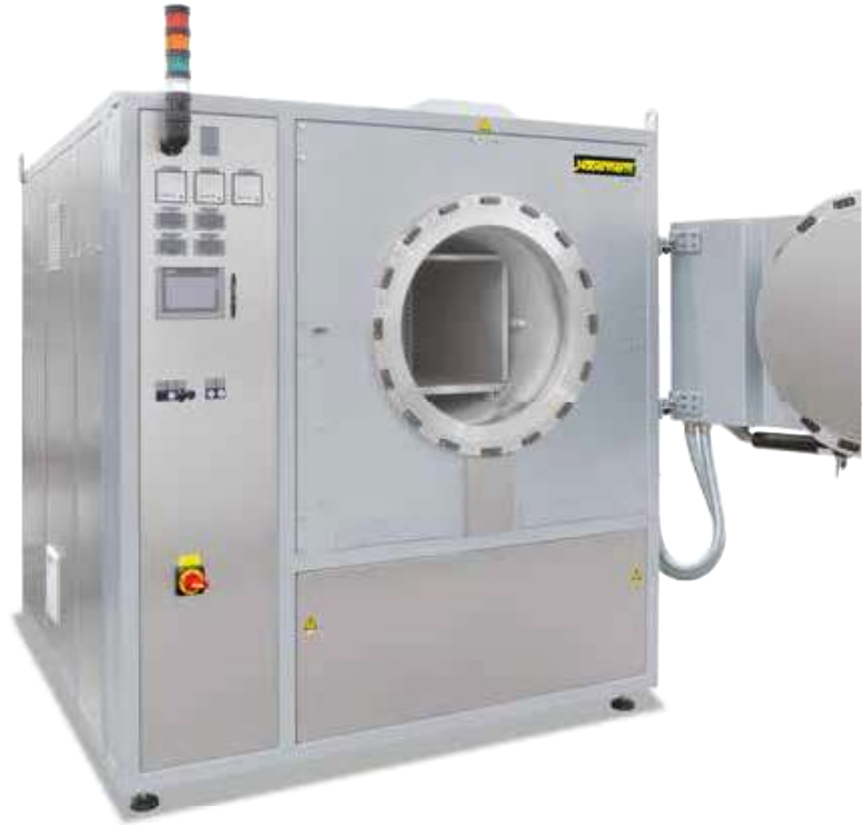
Hot-wall retort furnace NRA 150/09 for debinding and pre-sintering of cobalt-chromium blanks under inert and reactive gas atmosphere

In addition to the furnaces shown in the laboratory scale, Nabertherm also offers numerous solutions for production. For the production of zirconia blanks there are e.g. production plants that initially provide for the debinding followed by the presintering of the product. In these plants, highest precision with regard to temperature uniformity and reproducibility is of utmost importance in order to satisfy the requirements on the blank with respect to shrinkage and compliance with the later sintering temperature.