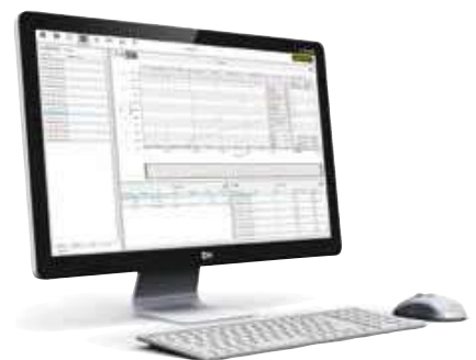
VCD Software for Control, Visualisation and Documentation