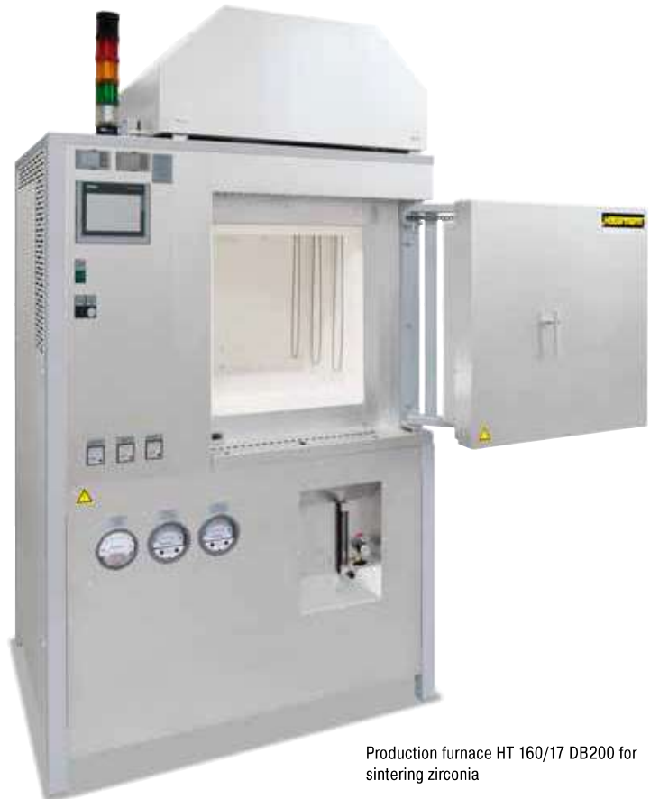
Production furnace HT 160/17 DB200 for sintering zirconia

For the full sintering of milled crowns and bridges in production scale, Nabertherm offers high-temperature furnaces having a considerably larger capacity than the laboratory furnaces shown here. Nabertherm also offers retort furnaces for the production of blanks made of cobalt-chromium under inert and reactive gases. In this connection, please ask for our special "Advanced Materials" catalog.